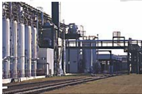
chemical industry plant

Because of the increasing production these filtration plants were not able to reduce these harmful substances. That was also the reason for the bad smell lying over the town.