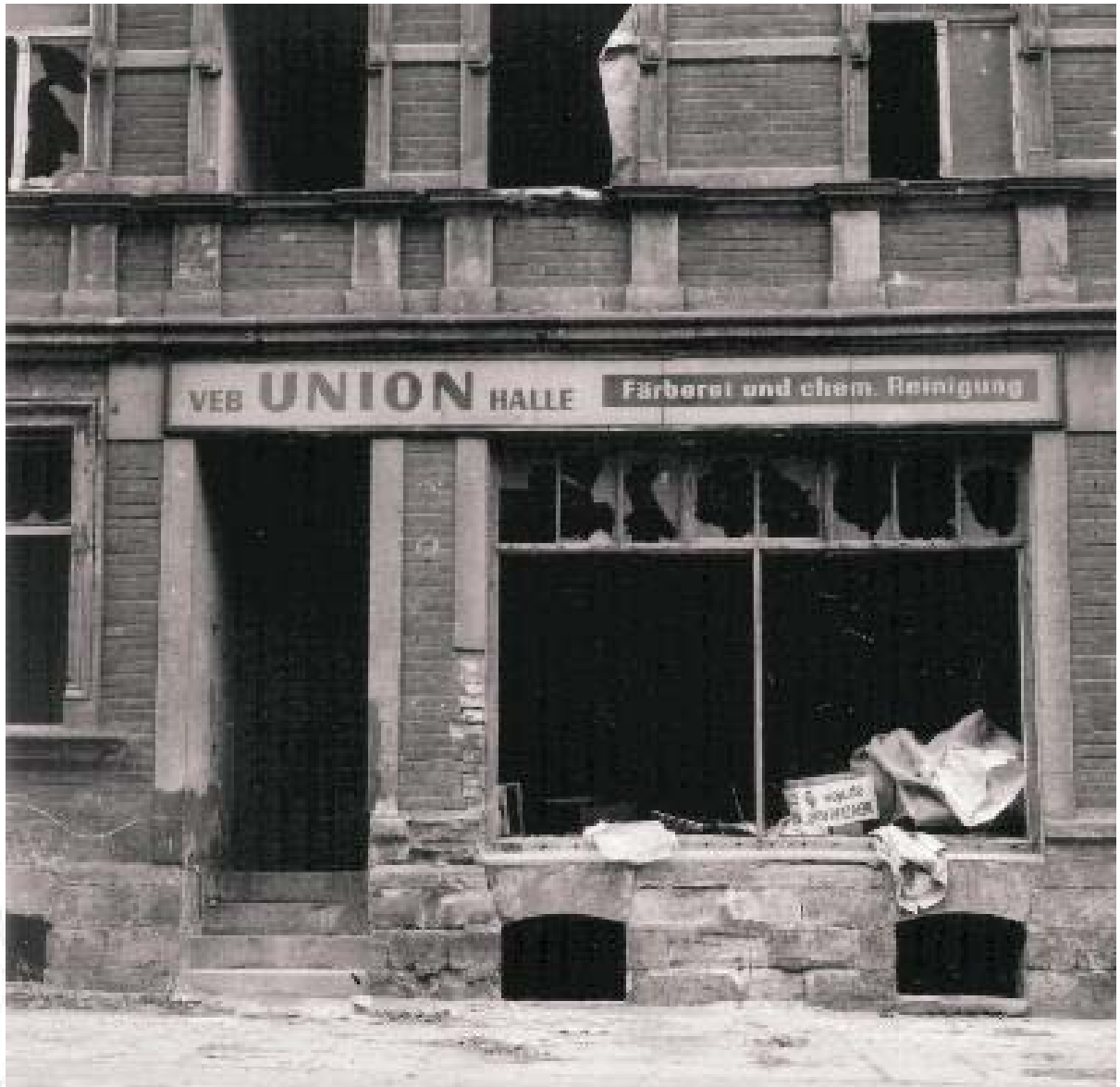
left building in Bitterfeld