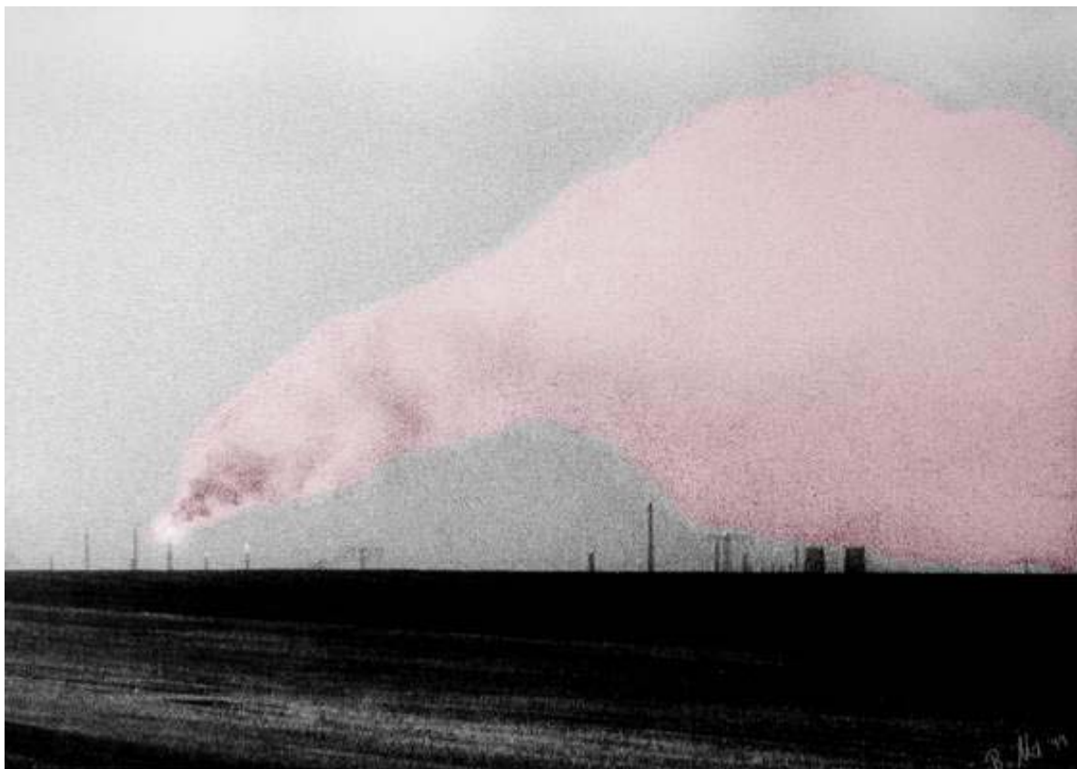
Industrial pollution in Bitterfeld

was no future and no possibility to learn a profession. Also the birth-rate declined very much in Bitterfeld. As a consequence the age structure of the population changed in the direction of senescence. Nearly only the old people stayed because they were used to live there. They still felt attached to their home in the contrary of the young people.