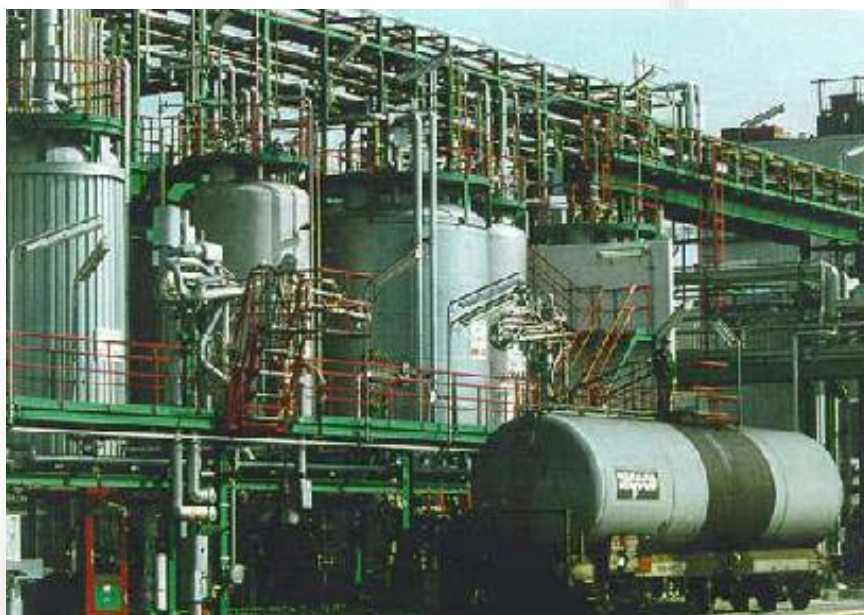
more chemical industries